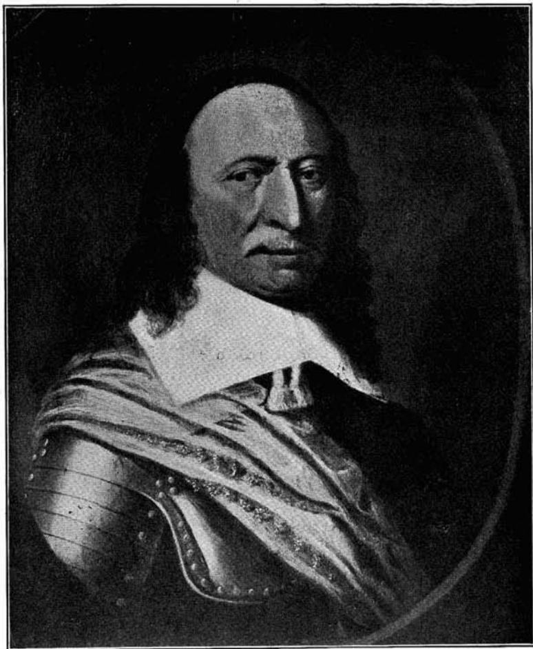
GOVERNOR PETER STUYVESANT