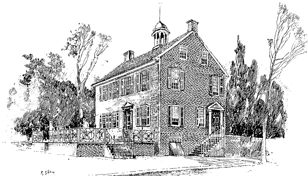
THE ORIGINAL COURT HOUSE, NEW CASTLE. BUILT ABOUT 1676